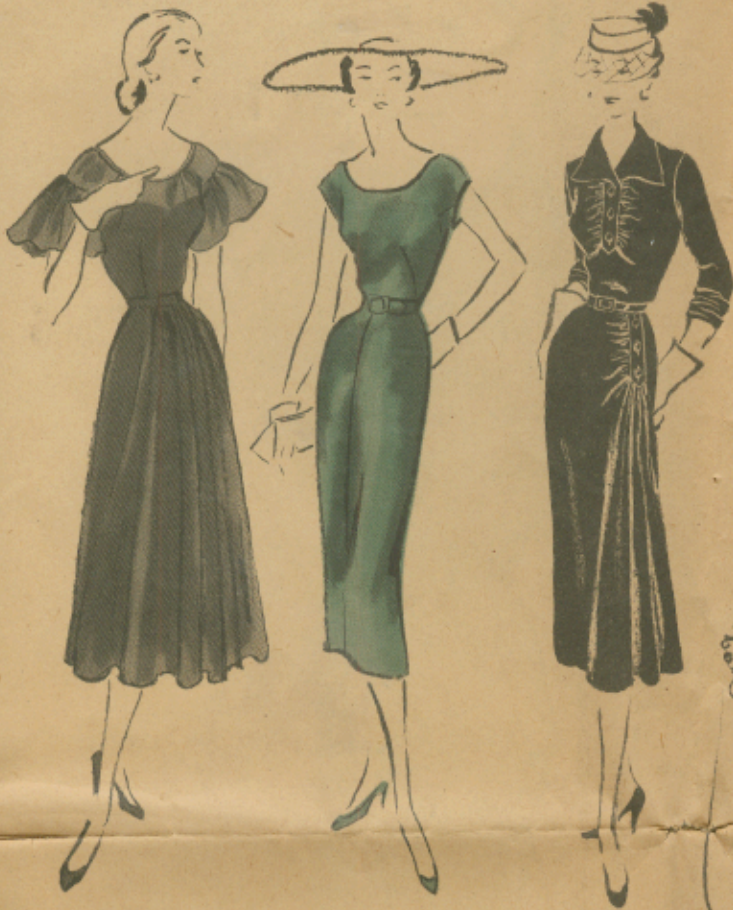
SHEER. NO. 7445 SATIN. NO. 7441 CRÊPE. NO. 7448