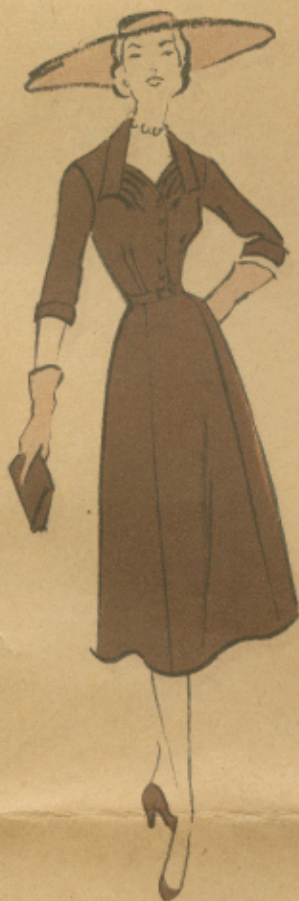
CRÊPE DE CHINE. NO. 7443